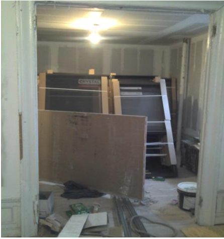
Photo 1 of 4 - Performance Level - 1F living rm.

Site Visit: December 23, 2011 (8:30am to 10:35am)