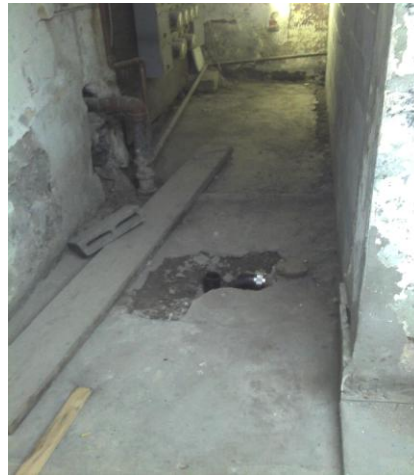
Photo 4 of 4 - Performance Level - basement drain