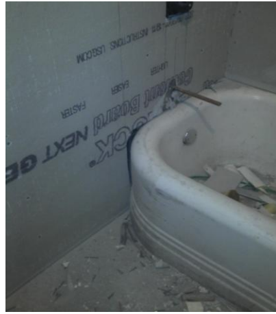
Photo 2 of 4 - Performance level - 1F bathroom